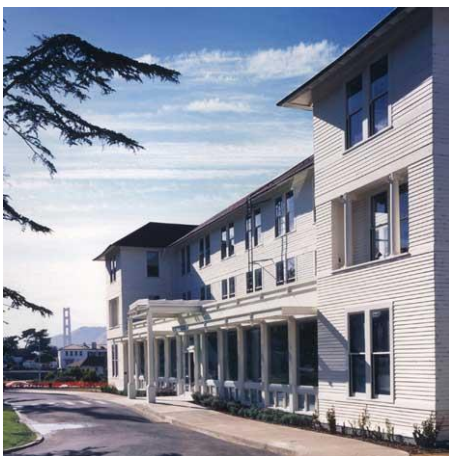
Thoreau Center for Sustainability, Presidio