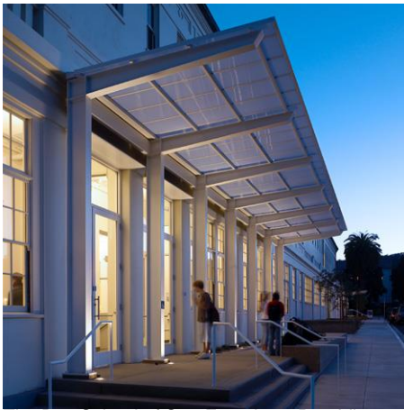
The Bay School of San Francisco, Presidio