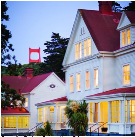
Cavallo Point, Sausalito, CA