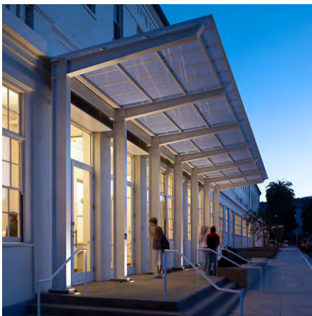
The Bay School of San Francisco, Presidio