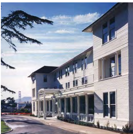
Thoreau Center for Sustainability, Presidio