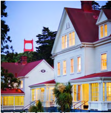
Cavallo Point, Sausalito, CA